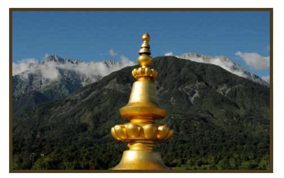
'As forests still the mind and promote stability They are perfect for abiding peacefully at ease On the banks of a river attention is sharpened And the desire to be free comes swift and new.' -Longchenpa